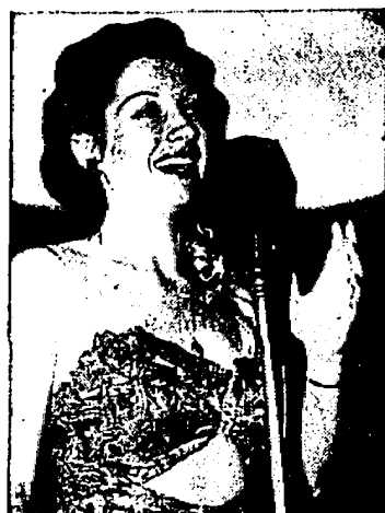
Helen Forrest is the songstress with Harry James' orchestra to be heard over W-G-N-Mutual at 11:35 tonight.