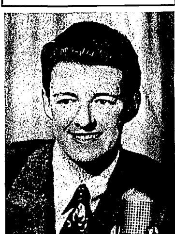
Fred Brady is the comedy star of the variety show presented over WBBM-CBS at 7 p. m. Fridays.